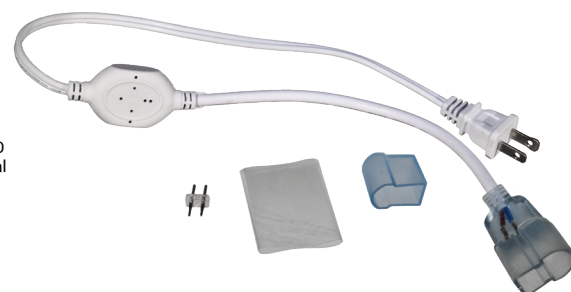
LED Neon Rope Light Power Cord, Shrink Wrap & End Cap pre-installed on all spools and custom cuts

Specifications are typical values and may change without notification ©2019 Brilliant Brand Lighting, All Rights Reserved