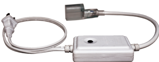
MINI INLINE CONTROLLER

RGB LED Rope Light controller required for color and effect selection, sold separately.