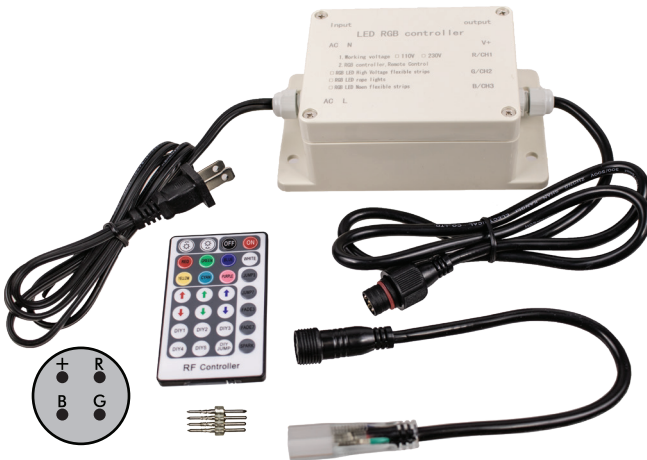
WEATHERPROOF DELUXE CONTROLLER