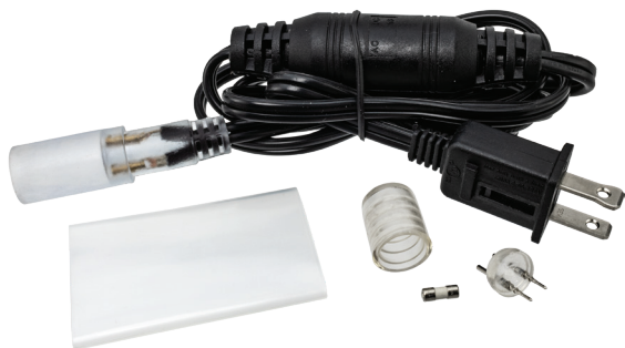
LED Rope Light Power Cord, Power Connector, & End Cap pre-installed on all spools