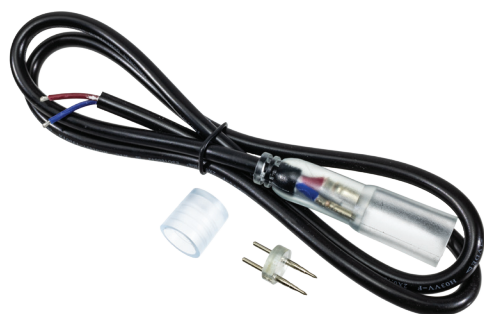
24V Rope Light Power Cord, Power Connector, & End Cap included with all spools