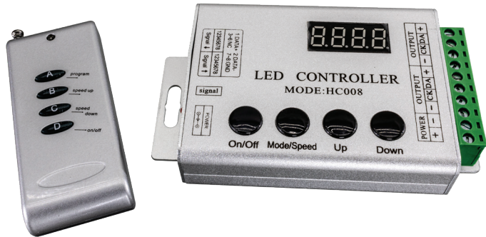
RF RGB LED CHASING CONTROLLER