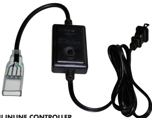
MINI INLINE CONTROLLER