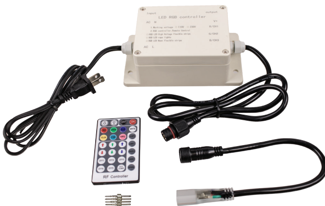
WEATHERPROOF DELUXE CONTROLLER