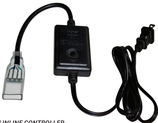
MINI INLINE CONTROLLER

RGB LED Rope Light controller required for color and effect selection, sold separately.